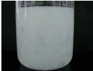
Very uniform dispersion of the fibers

WL-Bounce Adhesion has a FCM/Food Contact Material status - subject to auditing by proper authorities.